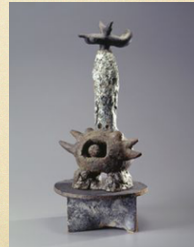
Joan Miró, Monument , 1956, earthenware