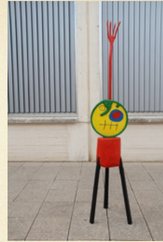
The Joan Miro Foundation Museum, Barcelona

The Dada movement encouraged Miro to use symbols in his paintings and later when he began sculpting he incorporated the same ideal. Miro often used exaggerated features and gestures in his art.