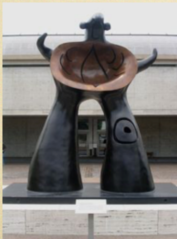
Joan Miro sculpture @ Kimball Art Museum, Ft. Worth T