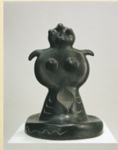
Joan Miró (1893-1983) Femme (Femme debout)