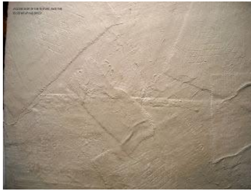
Dried - without color

The images were glued down with gel medium and the coins, gears and tokens were attached with Tacky Glue.