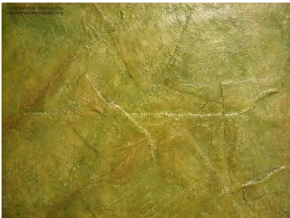
Dried - with color

The dragon was resized in my print program to a full page size and printed on heavy card stock. I applied Gelato pigment to my fingertip and then rubbed it on the image to avoid streaks. I also chose a background that had a dragon image on it and cut them both out.